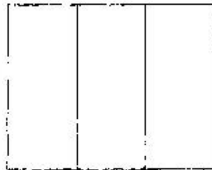
LOCATION OF MARKER